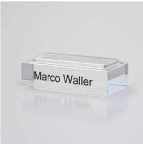
CATALOG SAMPLE ART