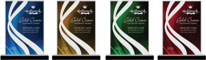
CATALOG SAMPLE ART

*Please specify: BL-Blue, GO Gold, GR-Green, RD- Red