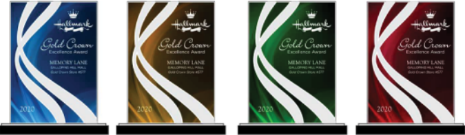
CATALOG SAMPLE ART

Job Name - Job# CD1022C* - Lasered (Front) w/Stock Background *Please specify: BL-Blue, GO Gold, GR-Green, RD- Red