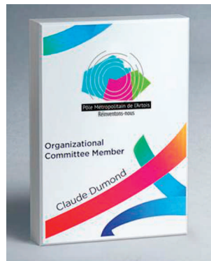
CATALOG SAMPLE ART