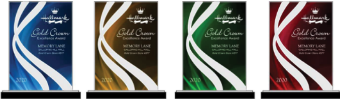
CATALOG SAMPLE ART

*Please specify: BL-Blue, GO Gold, GR-Green, RD- Red