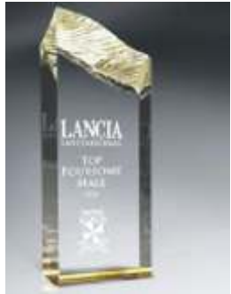
CATALOG SAMPLE ART