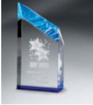
CATALOG SAMPLE ART