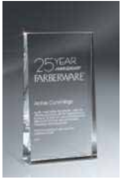
CATALOG SAMPLE ART