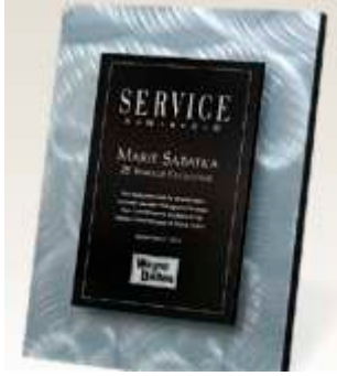
CATALOG SAMPLE ART