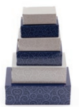
Navy & Gray Swirl