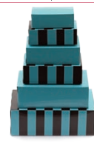
Light Blue & Brown