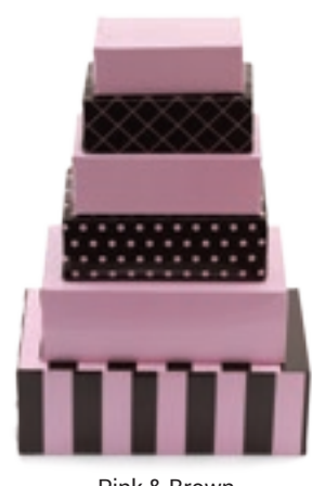
Pink & Brown