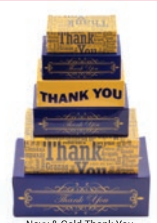
Navy & Gold Thank You